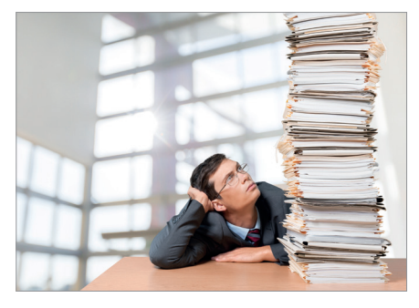
For continuous operation