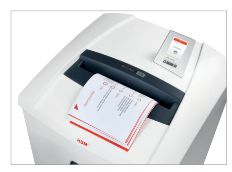
Anti-paper jam function

The operation is very easy: the device starts automatically when fed paper and automatically stops after shredding is complete.